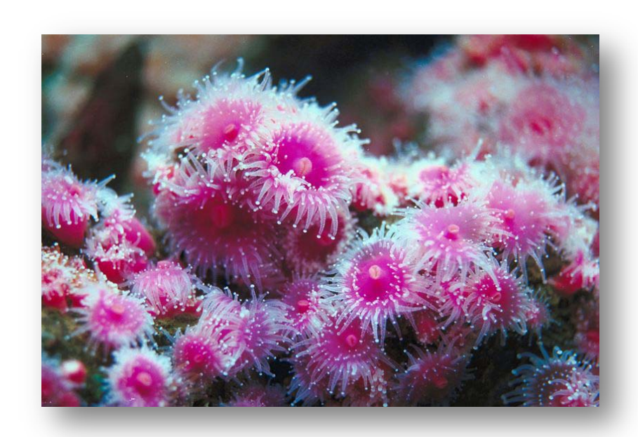
You find Sea Anemones in the ocean.