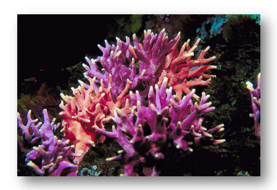
You find Coral in the ocean.