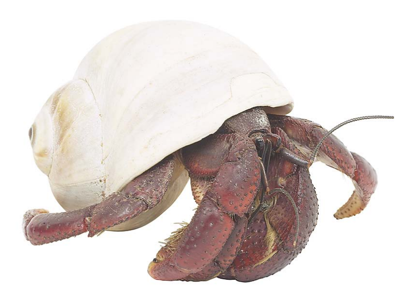
You find Hermit Crabs in the ocean.