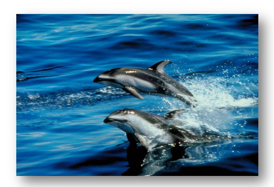
You find Dolphins in the ocean.