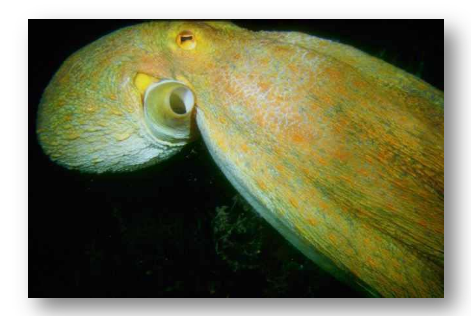
You find Octopuses in the ocean.