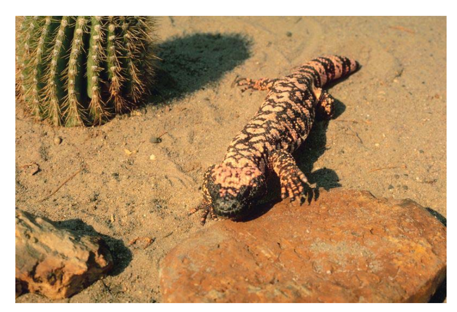
Gila Monsters are Desert Animals.