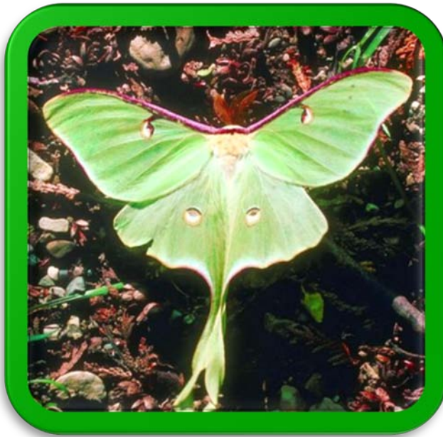
A Green Luna Moth