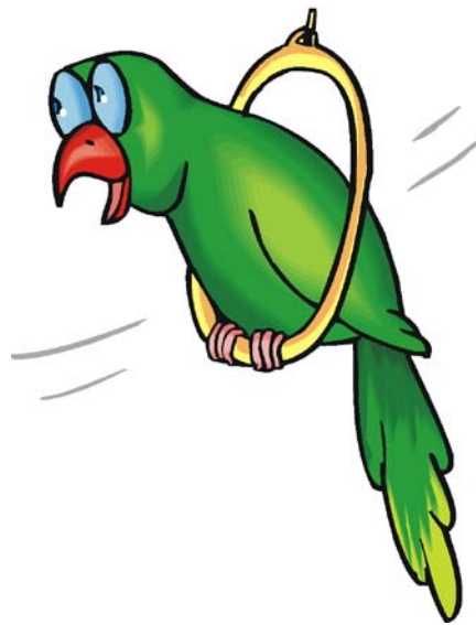
A Green Parrot