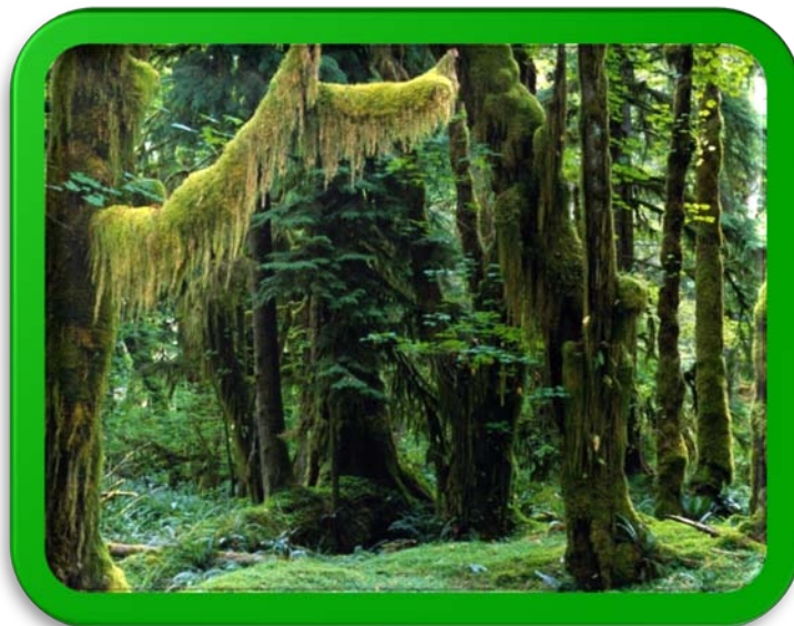
A Green Jungle