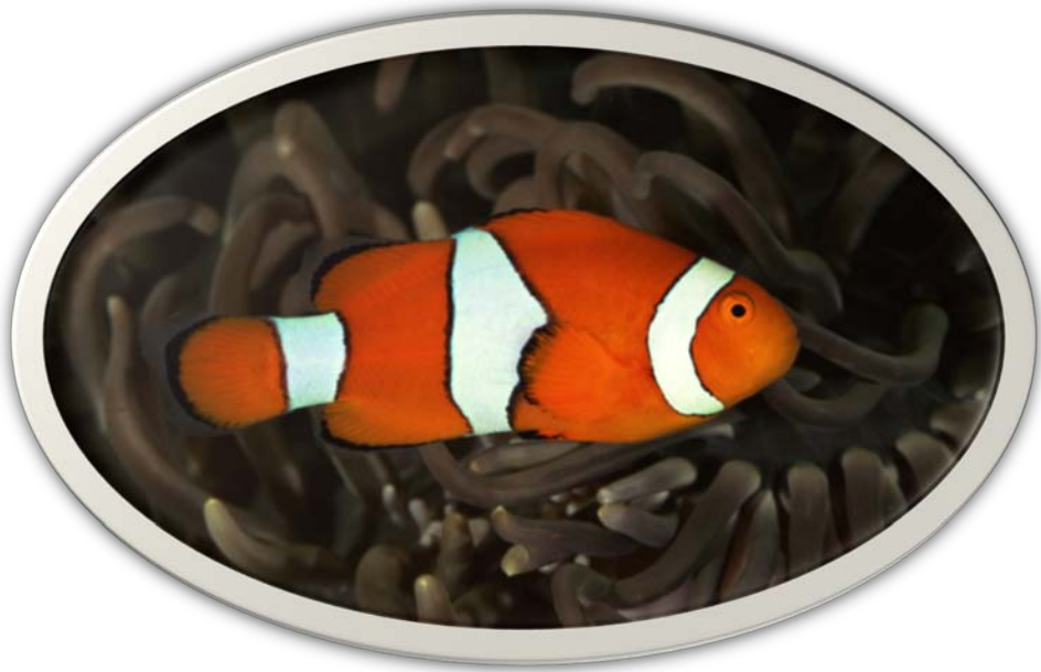
An Orange Clownfish