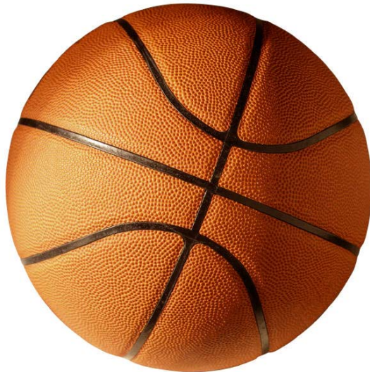
An Orange Basketball