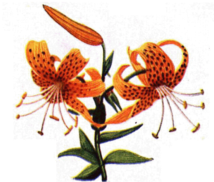
Orange Tiger Lilies