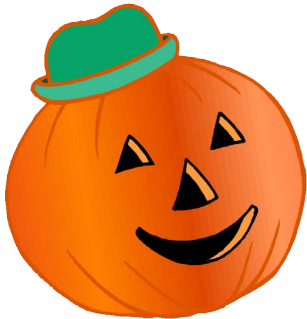
An Orange Jack-o-Lantern