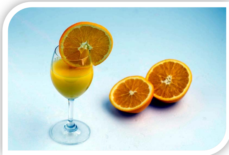
Orange Juice is Orange