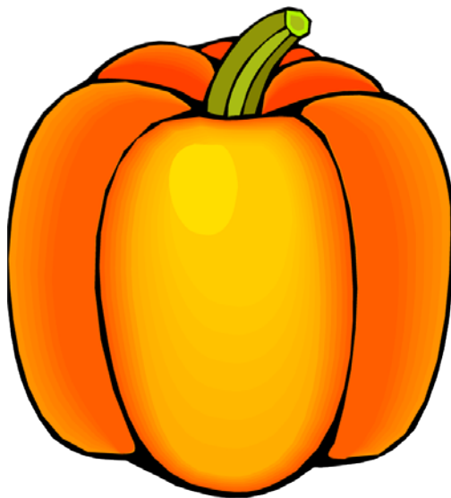
An Orange Pumpkin