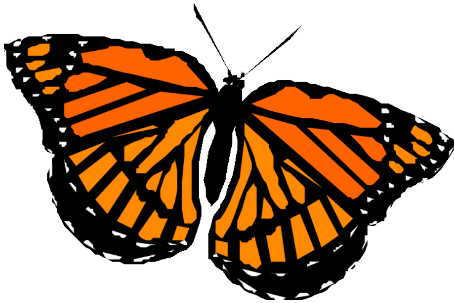
An Orange Butterfly