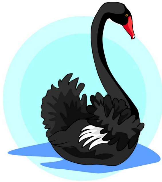
A Black Swan