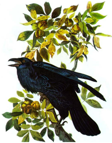
A Black Raven