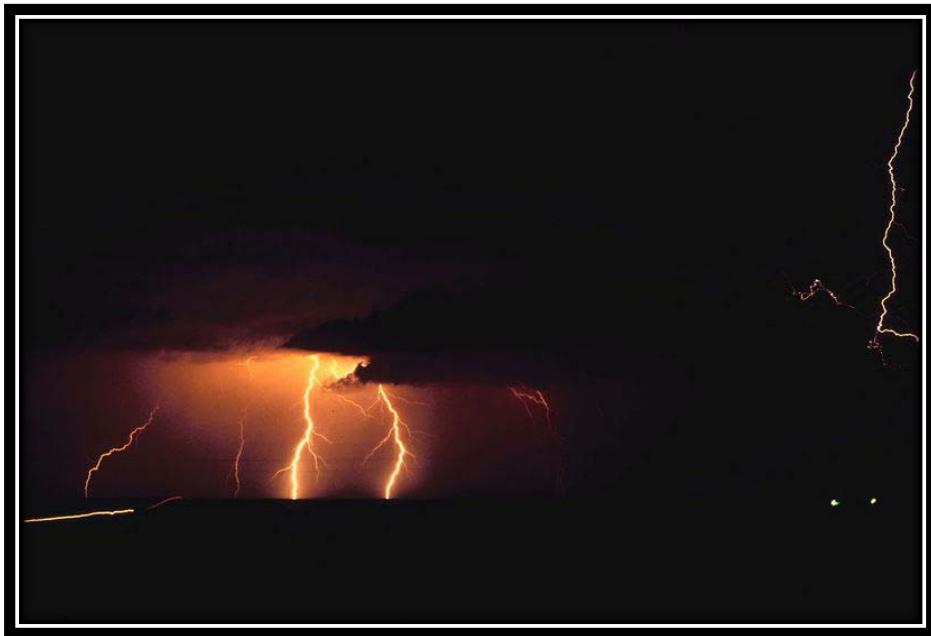
A Black Night