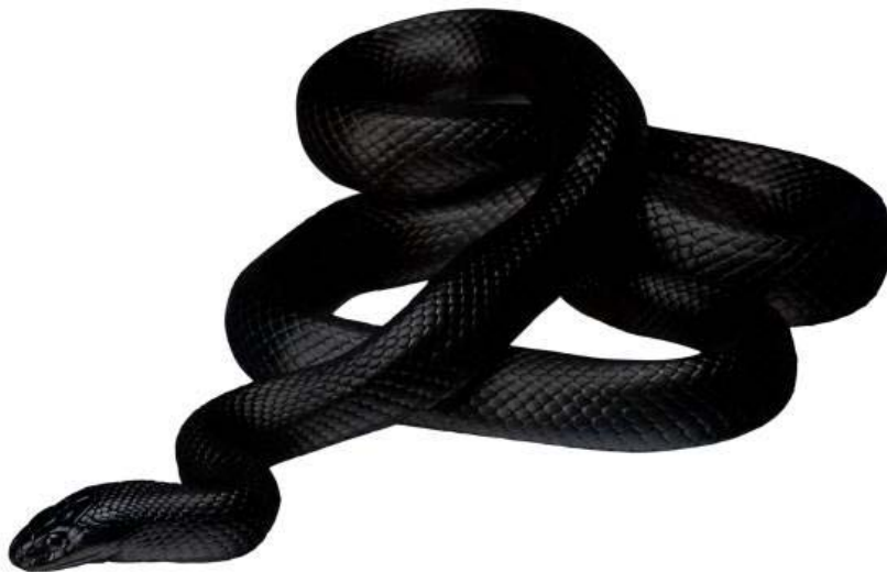
A Black Snake