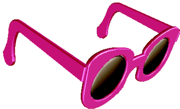
A Pair of Pink Glasses