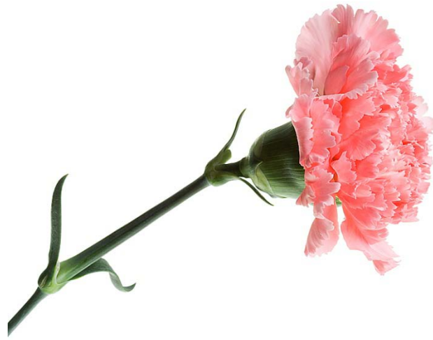
A Pink Carnation