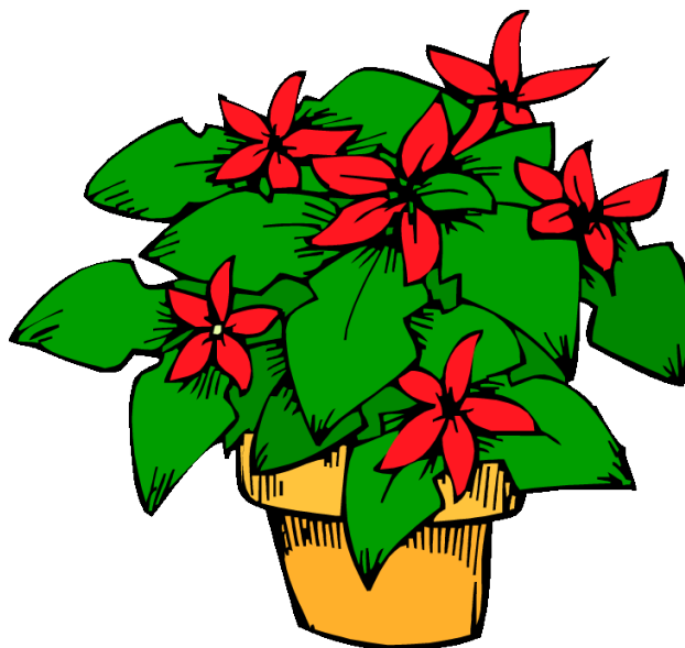
Red Poinsettia Flowers