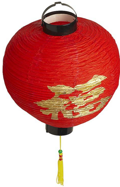
A Red Lantern