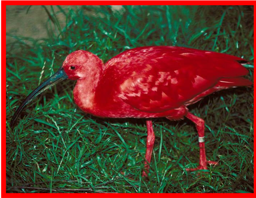
A Red Scarlet Ibis