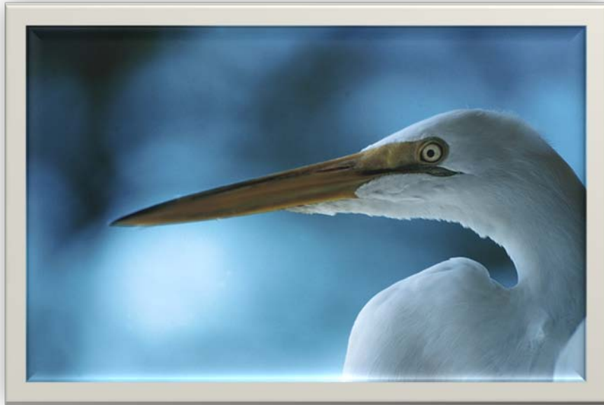
A White Egret