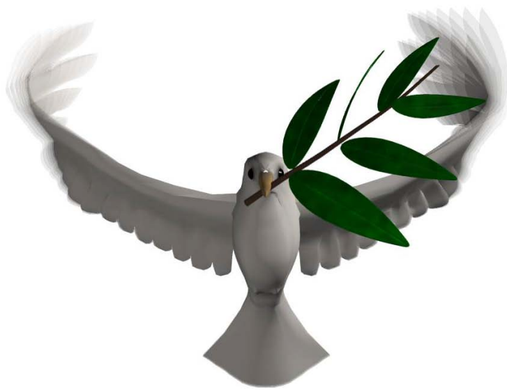
A White Dove