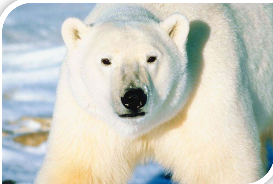
A White Polar Bear