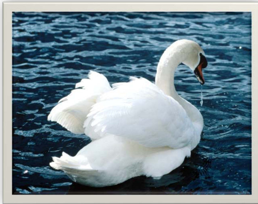
A White Swan