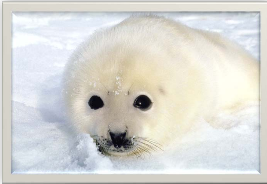
A White Baby Harp Seal