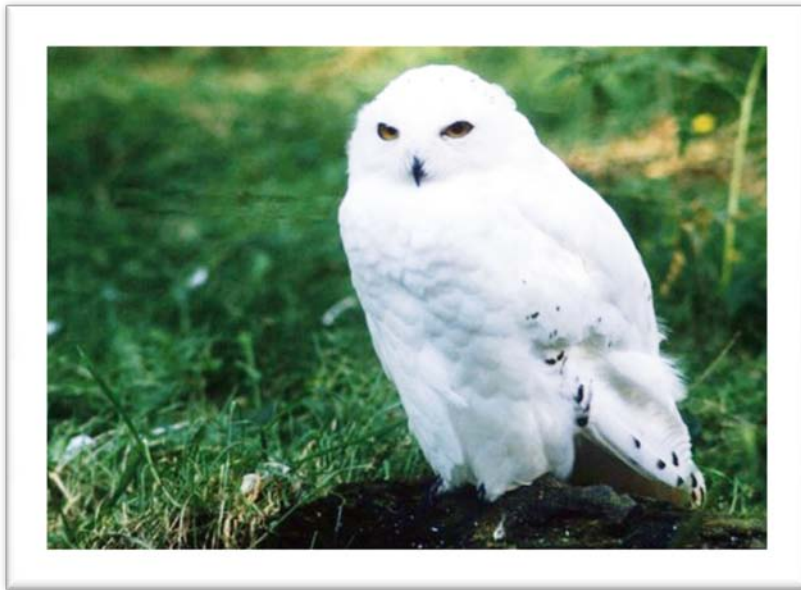
A White Snowy Owl