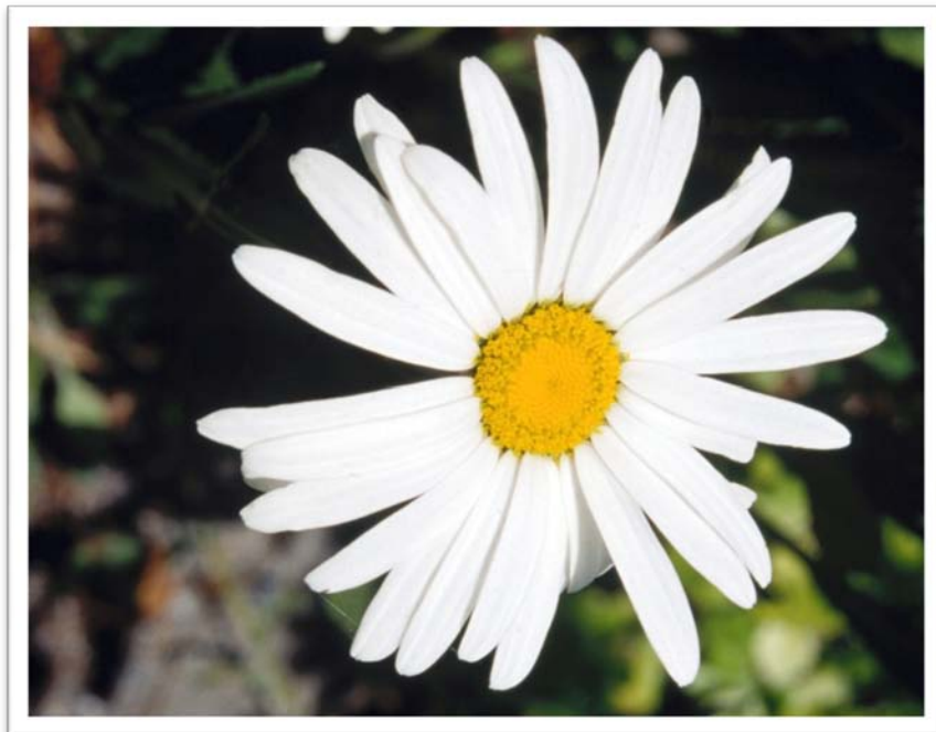
A White Daisy