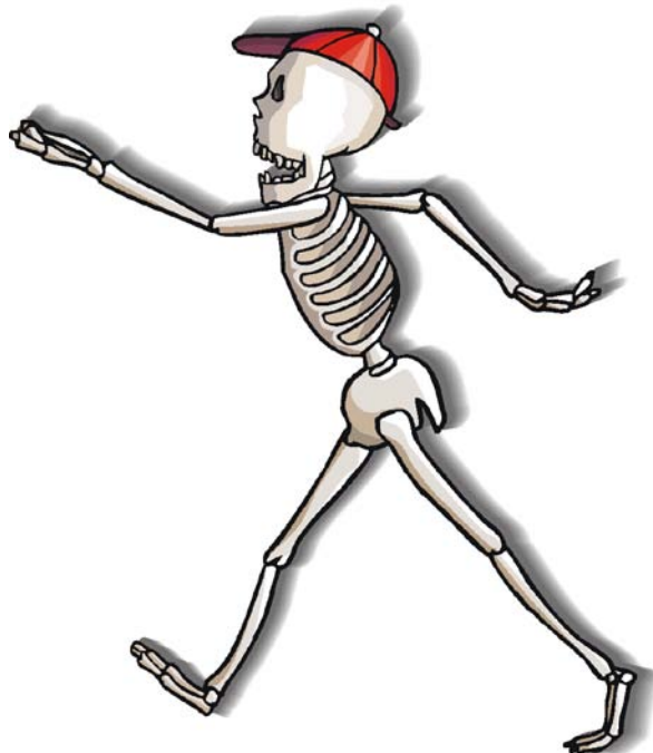
A White Skeleton