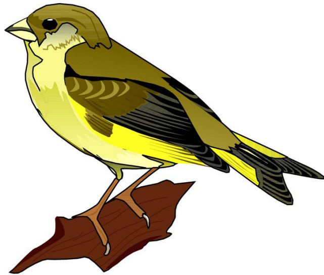
A Yellow Finch