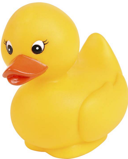
A Yellow Rubber Duck