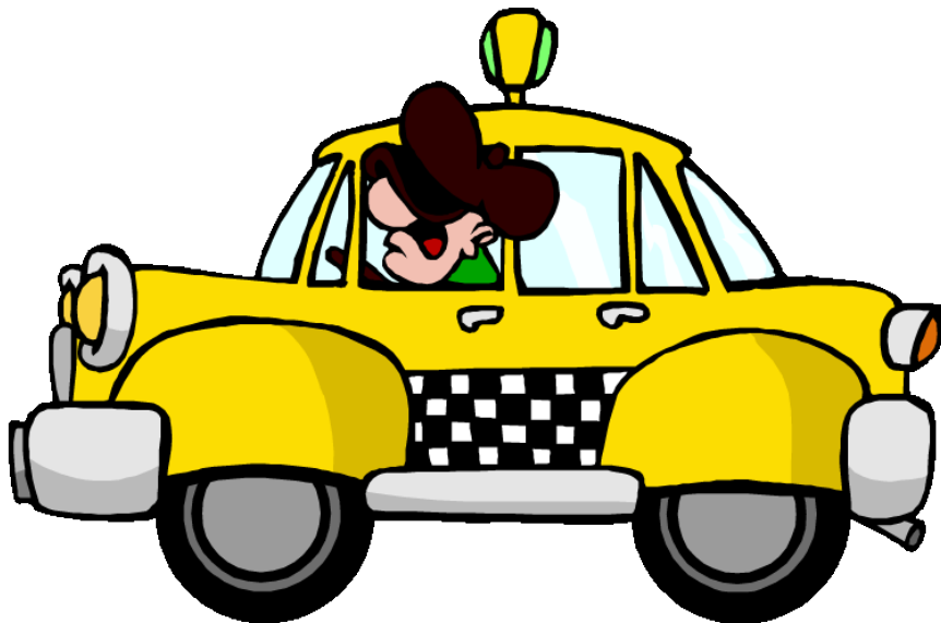
A Yellow Taxi