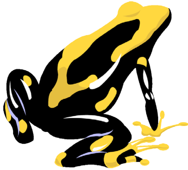
A Yellow Banded Poison Dart Frog