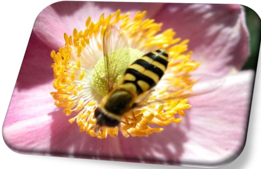
A Yellow Bumblebee