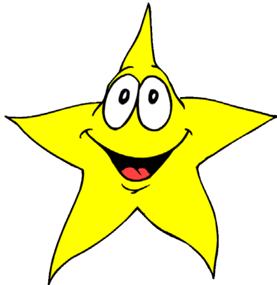
A Yellow Star