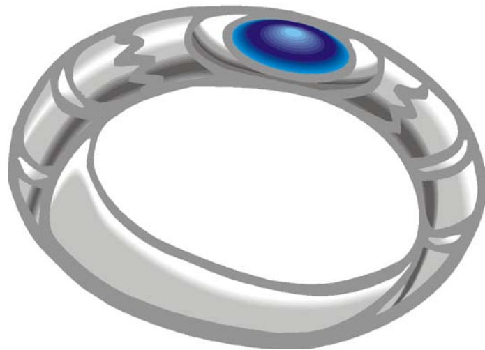
A Blue Sapphire