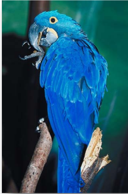
A Blue Parrot