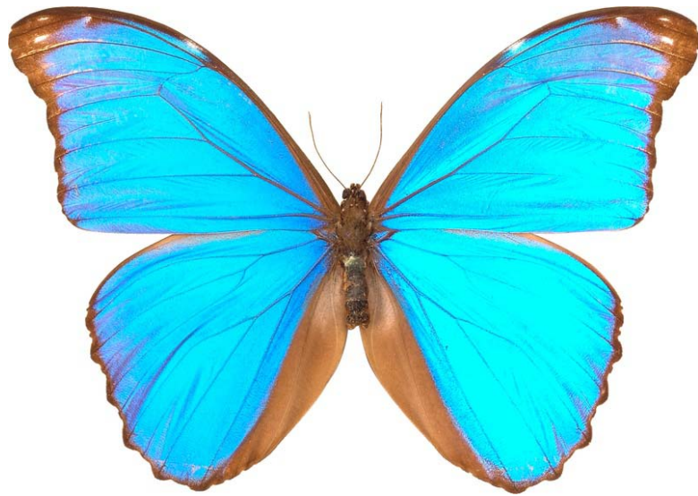
A Blue Morpho Butterfly