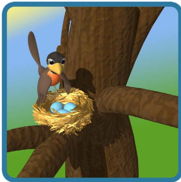
Blue Robins' Eggs