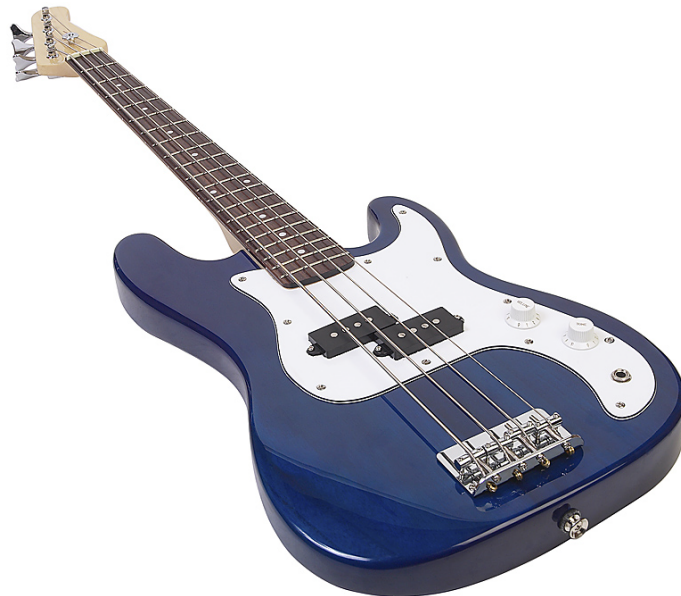
A Blue Guitar