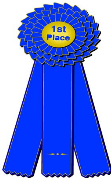
A Blue Ribbon