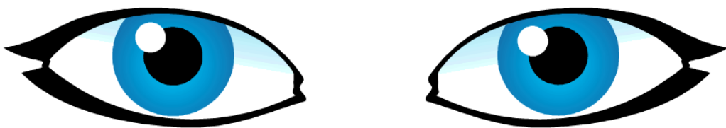
A Pair of Blue Eyes