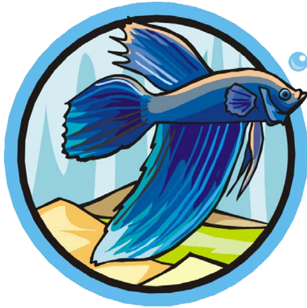
A Blue Betta Fish