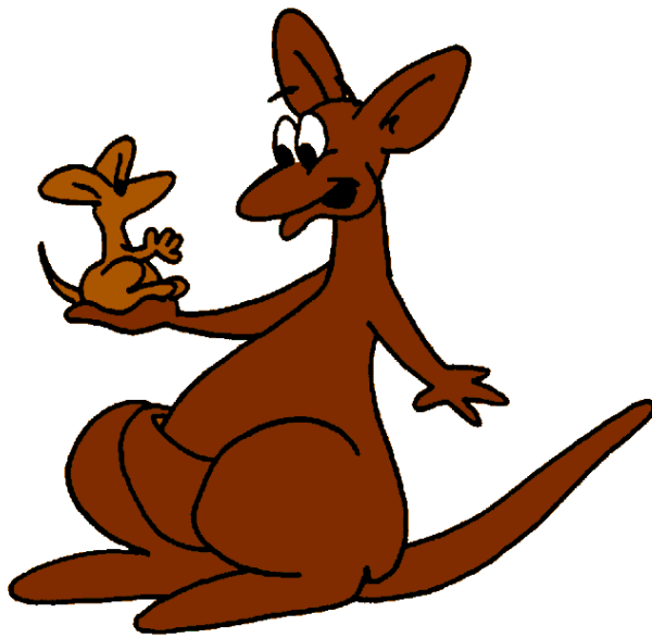
A Brown Kangaroo