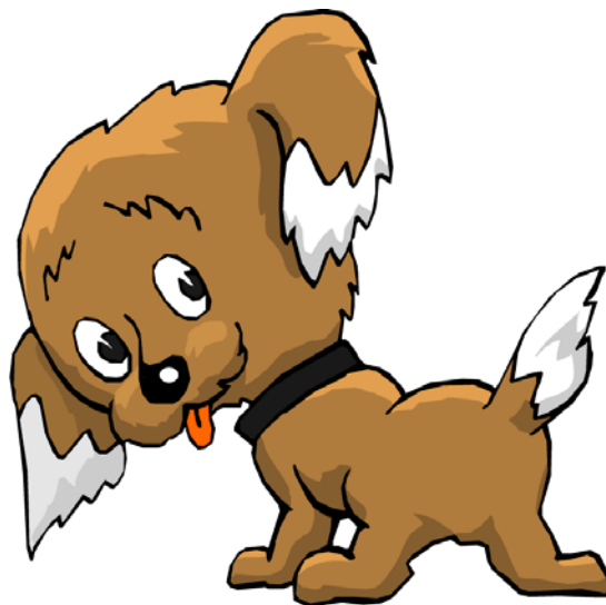
A Brown Puppy