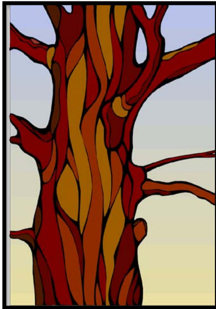
A Brown Tree Trunk