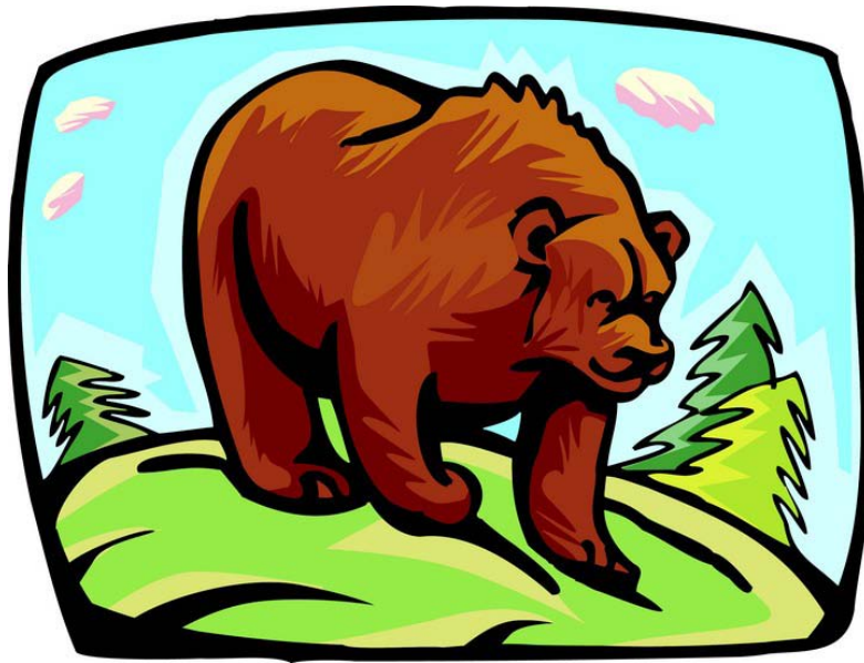
A Brown Bear