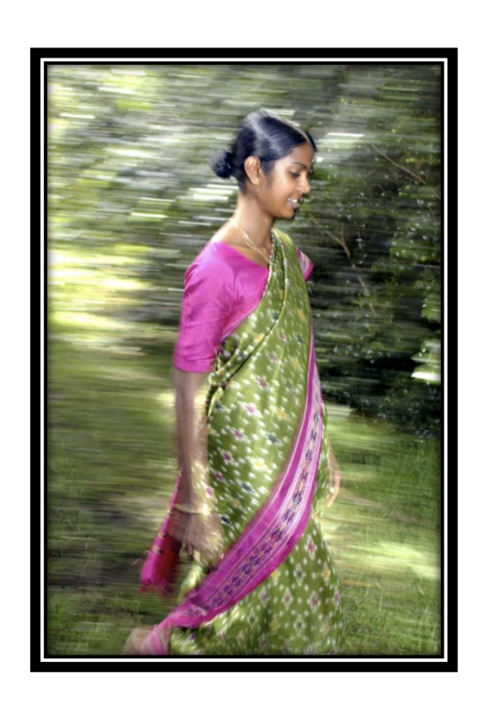
Silk dresses called saris