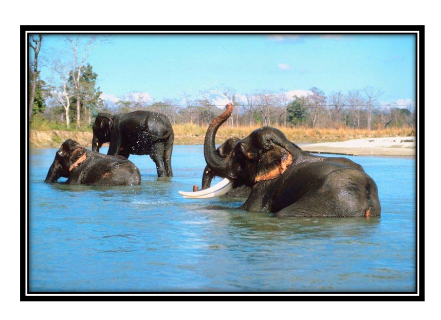
The Indian elephant