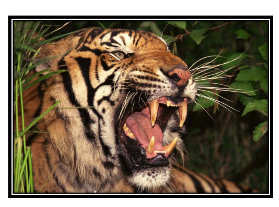
The Bengal tiger