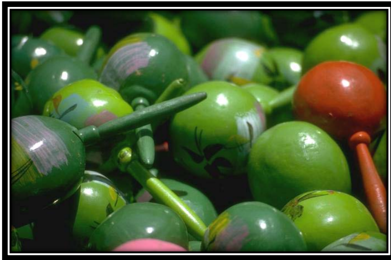
Musical instruments called maracas