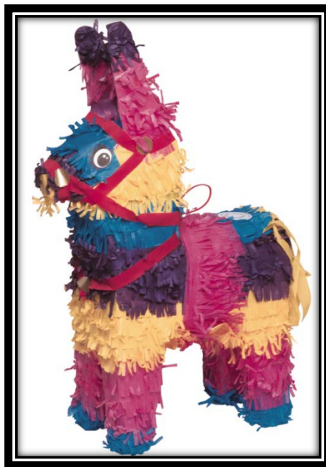
Piñatas filled with treats