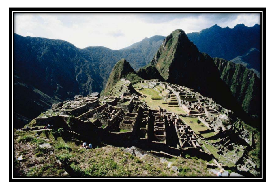
An ancient city called Machu Picchu