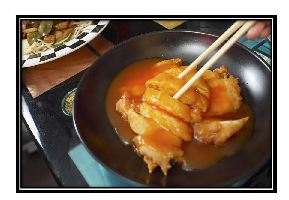
Eating with chopsticks