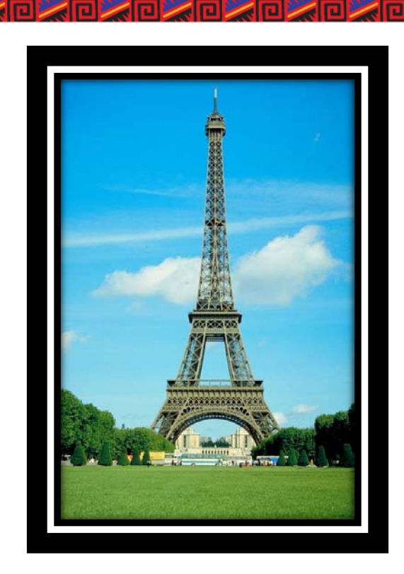
The Eiffel Tower