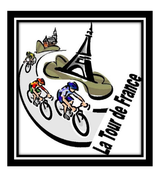
A cycling race called the Tour de France