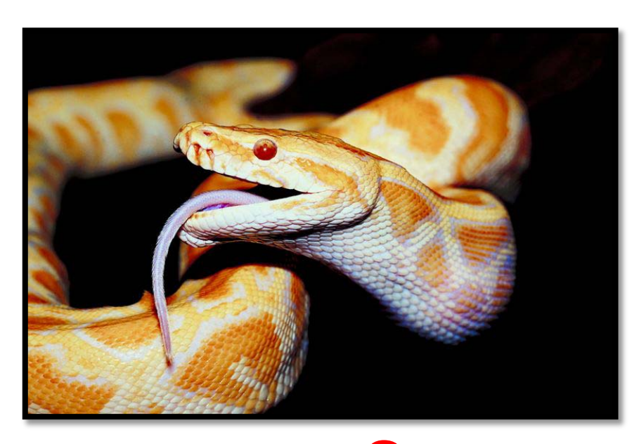
A group of Snakes is called a Bed.