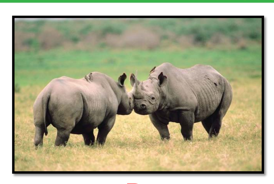
A group of Rhinoceroses is called a Crash.