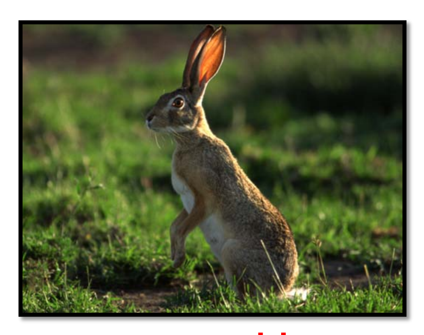
A group of Hares is called a Husk.