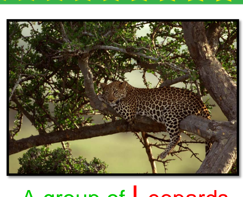
A group of Leopards is called a Leap.